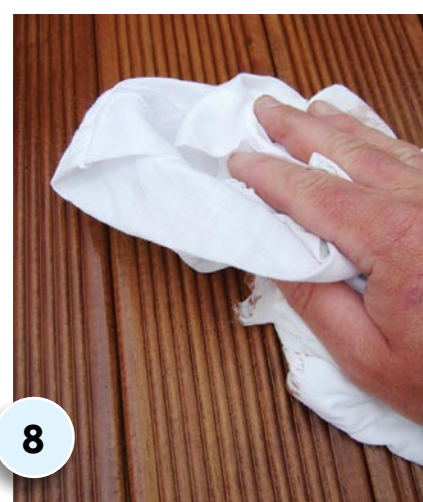
8 WIPE off any excess stain with a clean, lint-free cloth. Leave both the deck and raised bed to dry for 24 hours before applying a second coat.