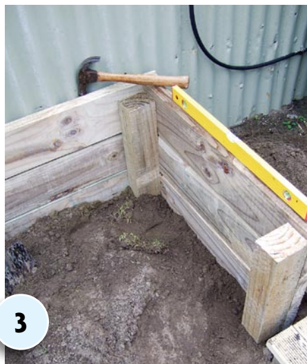
3 FORM the back of the raised bed by nailing three longer lengths of landscaping timber into two corner and one central support. Stand the back of the raised bed upright, sinking the supports into the holes and secure with rapid set concrete. Repeat with the shorter lengths of timber to form the side wall, as shown.