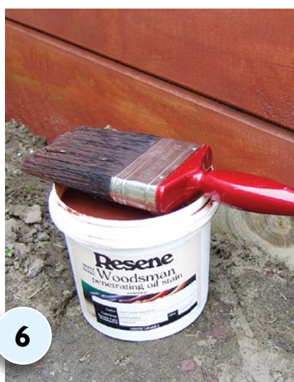
6 APPLY one coat of Resene Waterborne Woodsman in Resene Oiled Cedar to the raised bed, wiping off any excess with a clean, lint-free cloth.