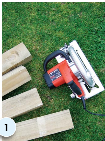
1 CUT the 100mm x 75mm fence posts into six 1m lengths to form the corner and central supports of the raised bed.