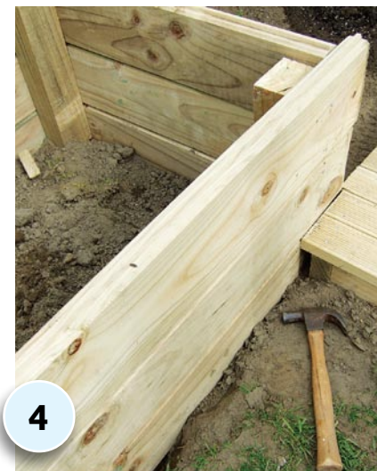
4 FORM the second side wall as described in step three. Fix the front of the raised bed to the central support and drop into position, nailing to the front corner supports, as shown. Ensure the walls are level and square and fix the central support into position with rapid set concrete.