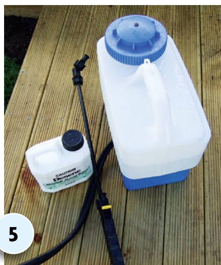
5 PREPARE the deck for staining by mixing one part Resene Moss & Mould Killer to five parts clean water and apply to the deck with a garden sprayer. Leave for 48 hours then wash off with clean water.