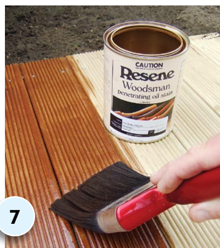
7 USING a large brush, apply one coat of Resene Woodsman in Resene Oiled Cedar to the deck, following the direction of the grooves.