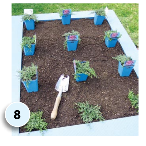
Position and plant the mat-forming thymes, as shown (we alternated woolly and 'Emerald Carpet' thyme). Allow plants to establish and spread (approx 30cm) to create a foliage carpet. Once established, the seat can be used.