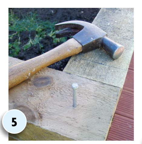
Repeat step three to make a second frame and fix this to the first frame, with agenerous amount of construction glue and a nail at each corner. (Drill a pilot hole first). Repeat this until you have five frames in position. Leave overnight for glue to dry.

Place this first frame into position – using a spirit level and large setsquare to make sure it's level and square.