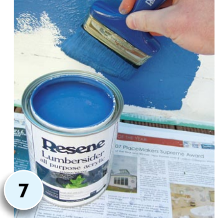
Paint the seat with two coats of Resene Magik, allowing two hours for each coat to dry. Fill the seat with good quality topsoil and/or potting mix, firm it down and finish it level with the seat's top edge.