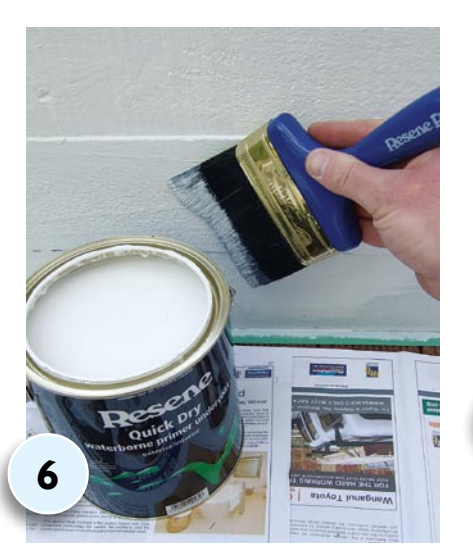
Apply one coat of Resene Quick Dry waterborne primer undercoat to the outer sides and top edge of the seat and leave to dry for one hour.