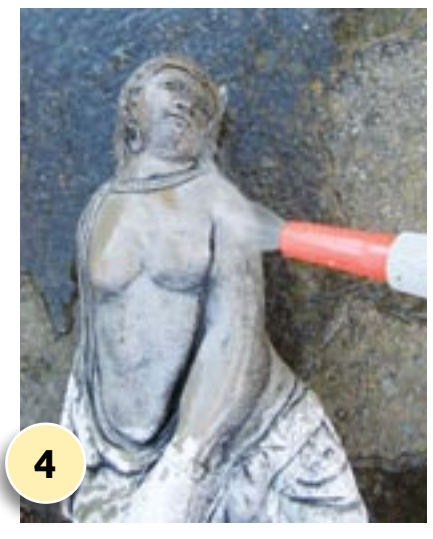
Wash the figurine thoroughly with clean water and then allow it to dry.