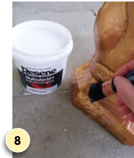
Apply one coat of Resene Multishield+ gloss, allowing two hours for it to dry.