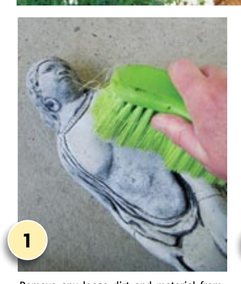
Remove any loose dirt and material from the concrete figurine (or ornament) with a stiff bristled brush, as shown.