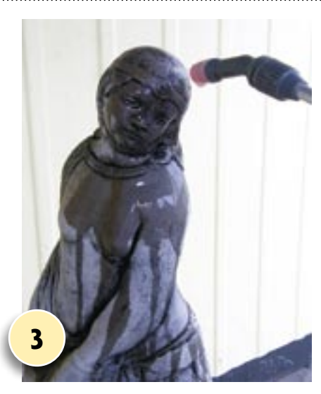
Spray the figurine with a generous amount of the solution. Leave for 48 hours.