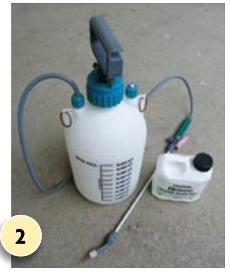
Mix one part of Resene Moss & Mould Killer to five parts of clean water and pour the solution into a garden sprayer.