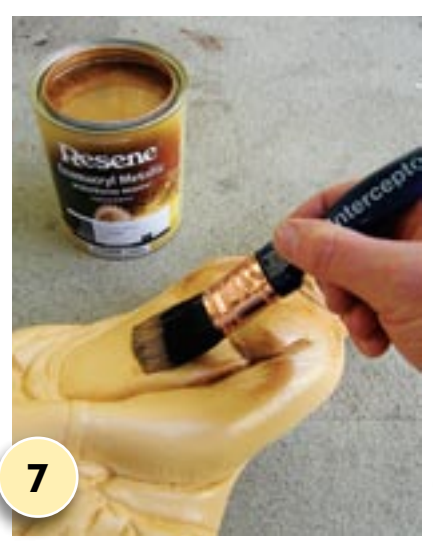
Apply two coats of Resene Bullion, allowing two hours for each coat to dry.