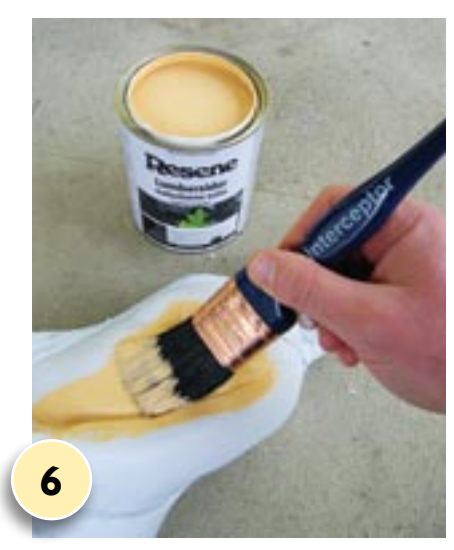
Apply one coat of Resene Porsche and allow two hours drying time.