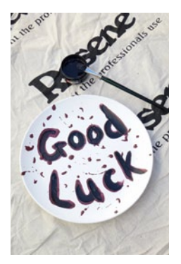
Step seven Paint over the words with Resene All Black, allowing some of the underneath colour to show through at the edges. Allow to dry.

Step six Before the second coat has dried, paint the words 'Good Luck' across the plate using Resene Volcano, allowing some of the paint to intermix. Splatter the plate with a few drips of Resene Volcano and allow to dry.