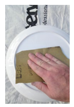
Step one Lightly sand the plate to 'key' the surface and wipe off any sanding dust with a clean cloth.