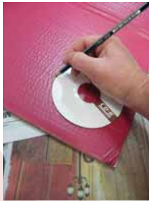
Step five Use the pencil to draw around the CD, creating a pattern of circles over the screen.