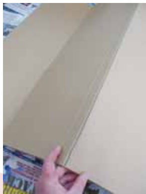
Step one Fold the piece of cardboard into three equal sections, as shown.