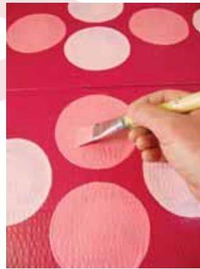
Step six Using the flat artists' brush, paint the circles with two coats of Resene Cabaret and Resene Illusion. Allow two hours for each coat to dry, and then stand your screen upright. Awesome!

Transform a simple square of cardboard into a funky bedroom screen with a little bit of help from Resene.