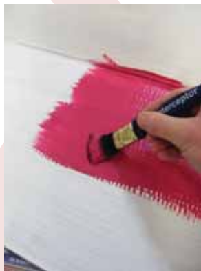
Step four Paint the screen with two coats of Resene Geronimo, allowing two hours for each coat to dry.