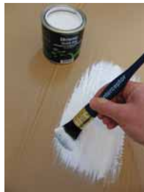
Step three Paint the screen with one coat of Resene Quick Dry and allow to dry for two hours.