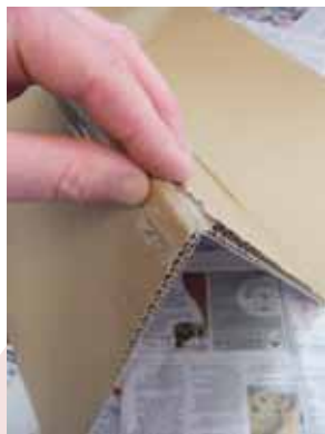
Step two Place a piece of sticky tape along the outer edge of each fold, carefully pressing down.