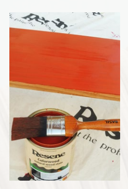
Step five Apply one coat of Resene Colorwood tinted to Resene Satin Orange to the bookcase.