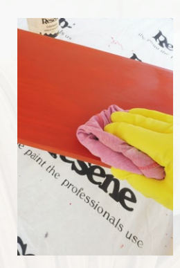
Step six Leave the Resene Colorwood for up to fifteen minutes before wiping off any excess with a clean cloth. Allow to dry.