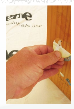
Step one Clean the bookcase with a damp cloth and remove any stickers.