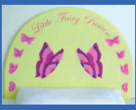
Butterflies are the bedtime companions for a Little Fairy Princess.

Funky, bold headboards using Resene paints feature in children's bedrooms with the launch of the Tamarillo Tree range of six headboard designs with options for customisation.