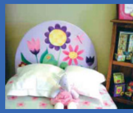
Flowers burst out in the Daisy Patch design.

Every headboard is specially matched to the room it is destined for. Customers send a photo of their child's room and Tamarillo Tree design a headboard to enhance the existing room.