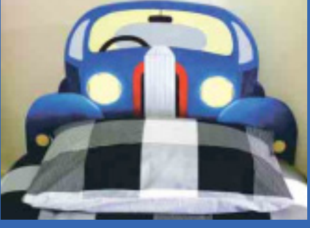
not surprisingly This Classic Car is painted in Resolution Blue with Red Berry detail.

While no two designs are the same, with themes ranging from the Classic Car to the Little Fairy Princess, they are all guaranteed to have two features in common - they're eyecatching and not surprisingly treasured by those