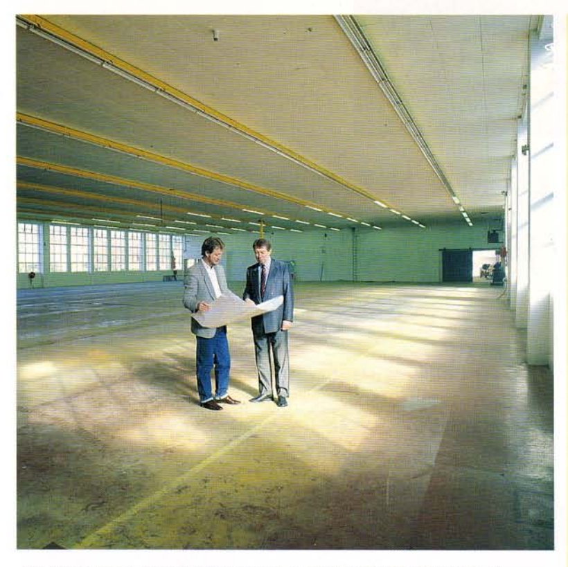
The new warehouse area will have the capacity to hold much increased volumes of Resene Paints' products.