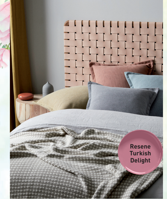
Weave Austin, Warwick

Pastels are less saturated than primary colours and offer a calm, soft, light feeling. The dreamy tones can take you back to simpler times, helping us escape from reality and colour-up a gloomy day.