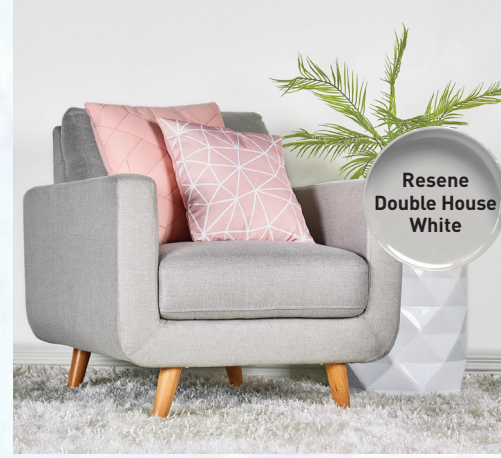
Vinnie Chair, Big Save Furniture

The Vinnie chair is upholstered with a gentle washed-out grey pastel, reminiscent of Resene Double House White. Furniture covered in neutral tones has a smart look, and with the addition of pastel coloured cushions acting as an accent this simple and