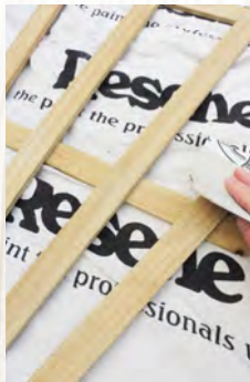
Step two Smooth any rough edges with sandpaper and wipe off any sanding residue with a clean cloth.