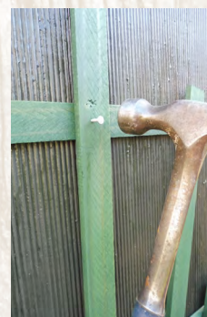
Step eight Fix trellis to fence using galvanised nails.