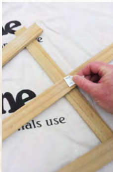
Step one Remove any labels from the fan trellis