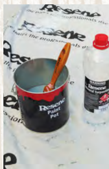
Step seven Wash brush in mineral turpentine.