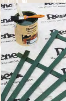
Step five Continue until the entire piece of trellis is covered in Resene Woodsman Wood Oil Stain. Allow 24 hours to dry.