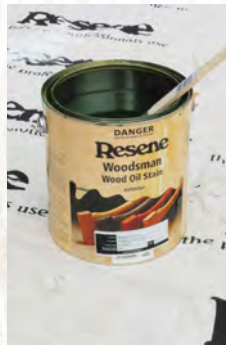
Step three Carefully stir the Resene Woodsman Wood Oil Stain.