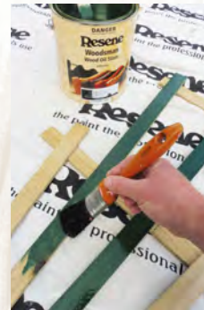
Step four Apply one coat of Resene Woodsman Wood Oil Stain to the back of the trellis. Once touch dry, turn over and apply one coat to the front of the trellis.