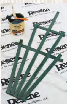
Step six Apply a second coat of Resene Woodsman Wood Oil Stain to the front and back of the trellis. Again, allow 24 hours to dry.