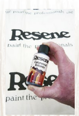
Step three Shake the Resene Colorwood Enhance.