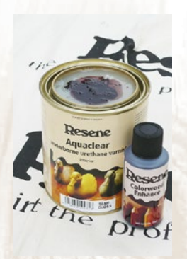
Step four Pour the Resene Colorwood Enhance into the Resene Aquaclear.