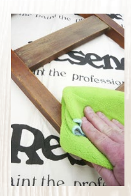
Step two Wipe off any sanding residue with a clean cloth.