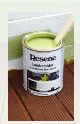
Step six Carefully stir the Resene Lumbersider.