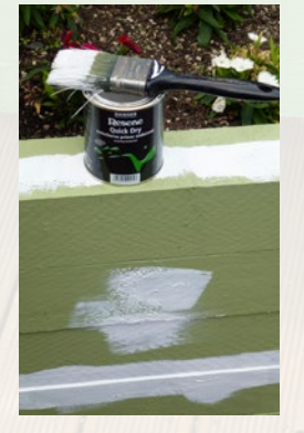
Step five Spot prime any filled gaps and areas of bare wood with Resene Quick Dry. Allow two hours to dry.

Check out more project ideas online www.resene.com/projects.