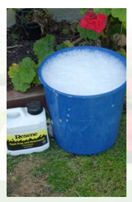
Step one Mix one part Resene Paint Prep and Housewash to three parts clean water.