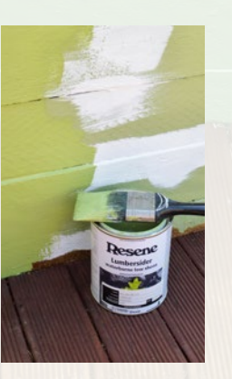
Step seven Apply one coat of Resene Koru to the raised bed and allow two hours to dry.