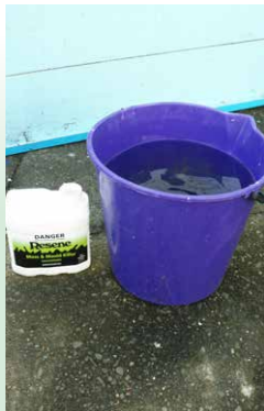
Step one Mix one part Resene Moss & Mould Killer to five parts clean water.