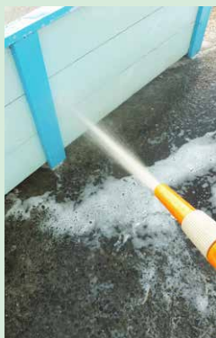
Step five Rinse the planter box with clean water and allow to dry.