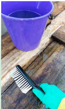
Step two Wearing rubber gloves, thoroughly soak the planter box with the solution and leave for 48 hours.