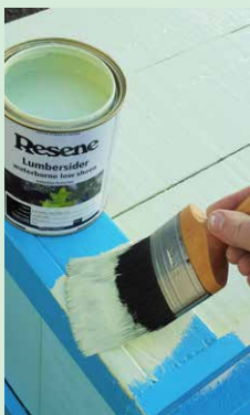
Step six Apply two coats of Resene Soft Apple to the front and sides of the planter box, allowing two hours for each coat to dry.