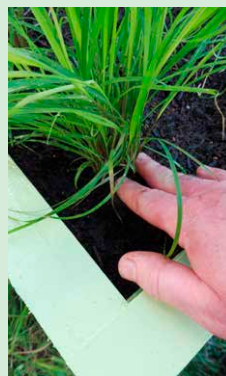
Step eight Fill the planter box with good quality potting mix and plant up with a selection of your favourite herbs and salad vegetables.

Give a new lease of life to an old wooden planter box using a combination of fresh Resene greens.