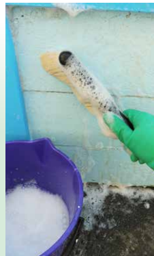
Step four Scrub the planter box vigorously with the solution using a stiff-bristled brush.