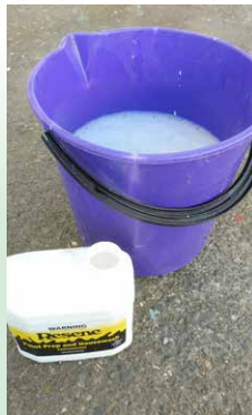
Step three Mix one part Resene Paint Prep and Housewash to three parts clean water.