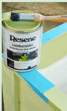
Step seven Apply two coats of Resene Green Smoke to the top and inner edge of the planter box, as shown, allowing two hours for each coat to dry.