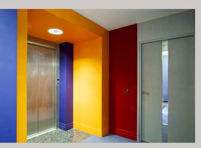
Architectural Specifier: Paris Magdalinos Architects www.pmarchitects.co.nz