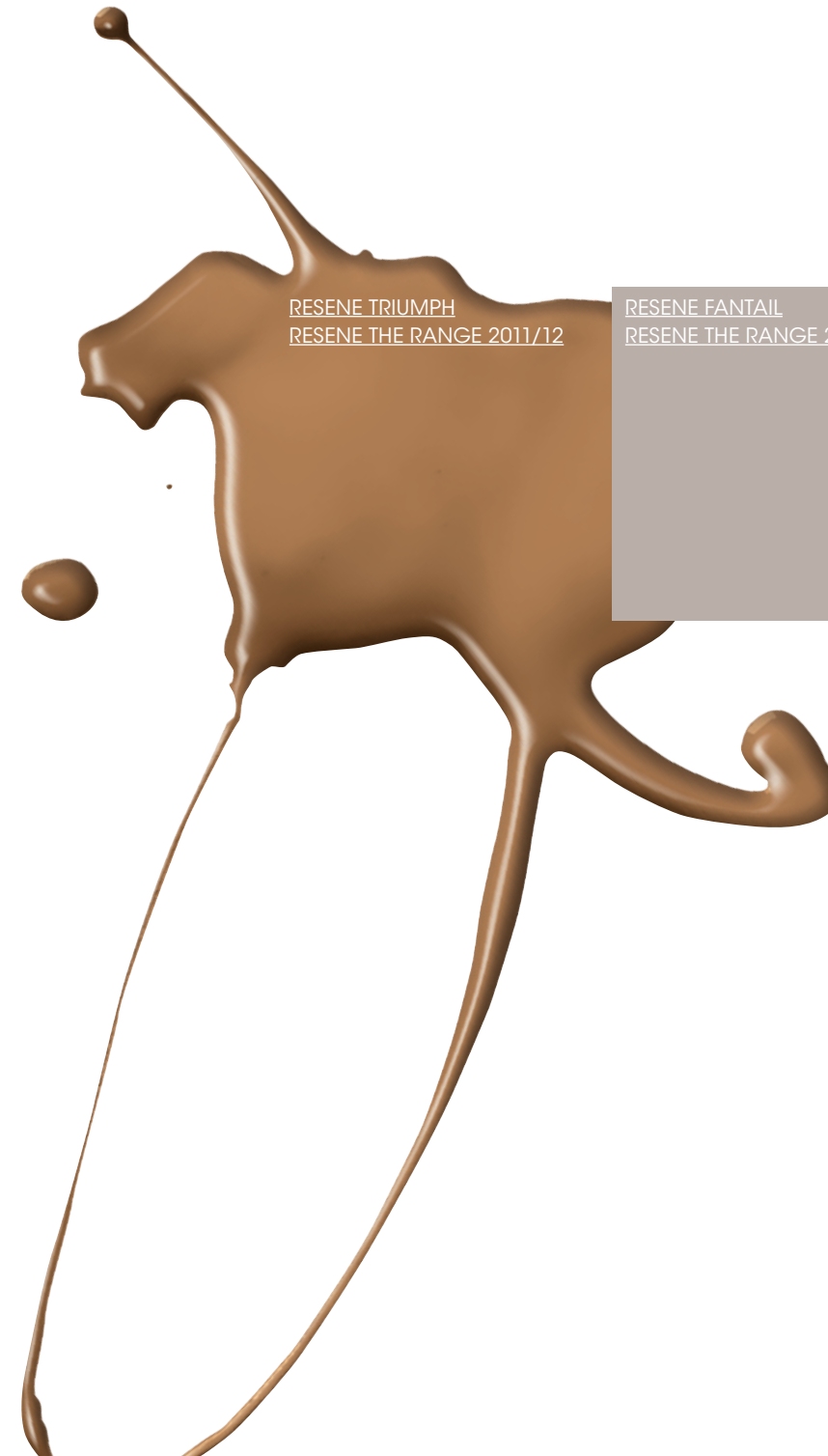
RESENE TRIUMPH RESENE THE RANGE 2011/12

Available from Resene ColorShops nationwide, ph 0800 RESENE (737 363) www.resene.co.nz